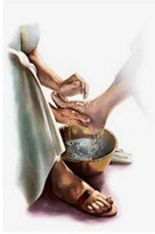
"You should wash each other's feet" (John 13:14).

Moynihans Irish Bar , located on the corner up the road from the Chapel, accepts any Donations, as well as food, toiletries or clothes for the PHP project.